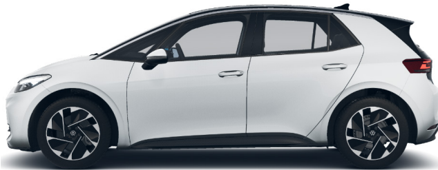
Glacier White Metallic PRO & PRO S PRO PLUS & PRO S PLUS