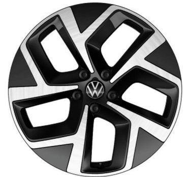
OPTIONAL ON ID.3 PRO MODELS 19" 'Wellington' alloy wheels 7.5J x 19 Tyres: 215/50 R19

For exact options prices for your vehicle, please contact your local dealer or visit www.volkswagen.ie