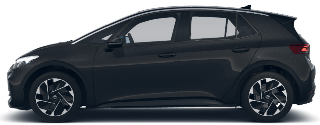
Mythos Black Metallic PRO & PRO S PRO PLUS & PRO S PLUS