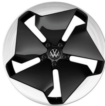
STANDARD ON ID.3 PRO S MODELS 20" 'Sanya' alloy wheels 7.5J x 20 Tyres: 215/45 R20