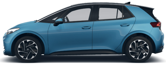
Costa Azul Metallic PRO & PRO S PRO PLUS & PRO S PLUS