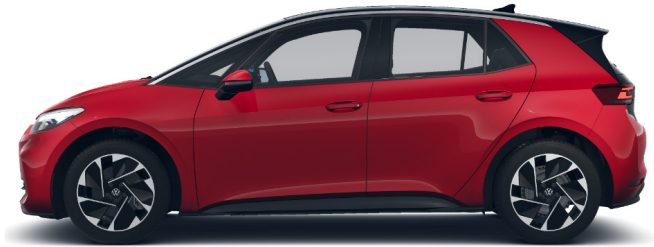
Kings Red Metallic PRO & PRO S PRO PLUS & PRO S PLUS