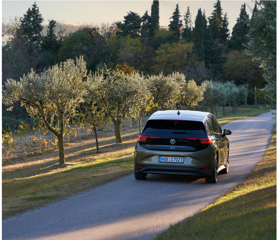
Note: The above image shows ID.3 with Exterior Package