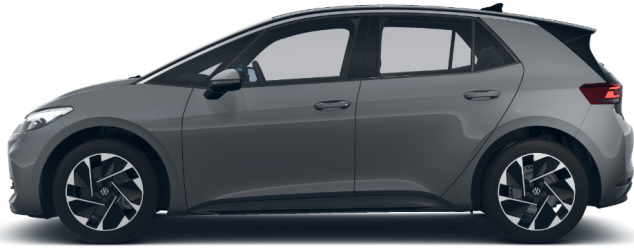
Moonstone Grey Solid PRO & PRO S PRO PLUS & PRO S PLUS