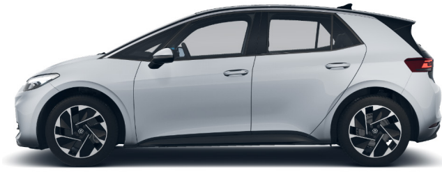
Scale Silver Metallic PRO & PRO S PRO PLUS & PRO S PLUS