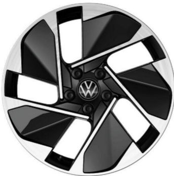
STANDARD ON ID.3 PRO PLUS 18" 'East Derry' alloy wheels 7.5J x 18 Tyres: 215/55 R18