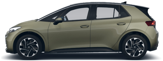
Dark Olivine Green Metallic PRO & PRO S PRO PLUS & PRO S PLUS